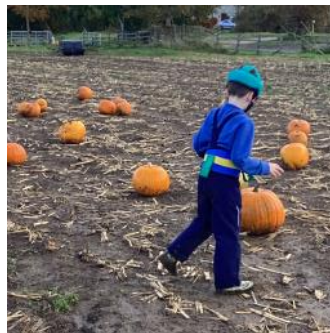
SR2 Visit the Pumpkin Patch