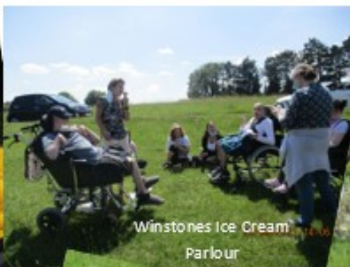
Winstones Ice Cream Parlour