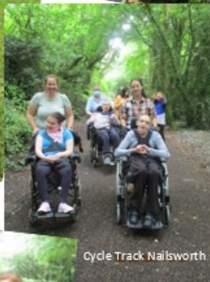
Cycle Track Nailsworth