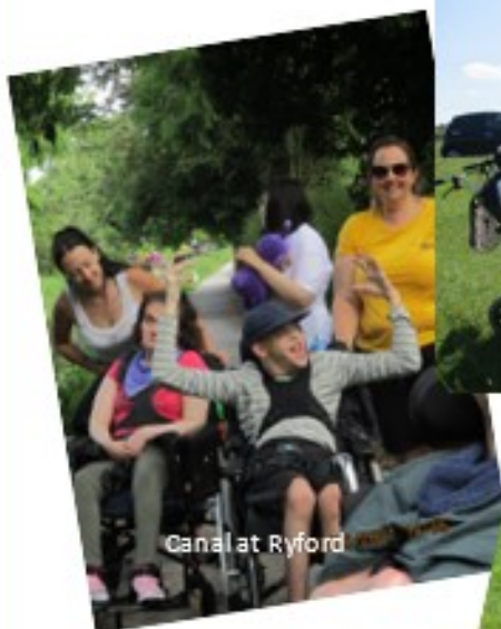
Canal at Ryford