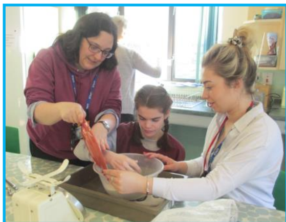
Creative cookery making biscuits with different flavours