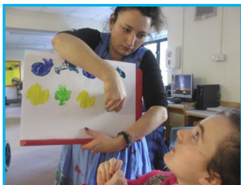
Creative work on sequencing