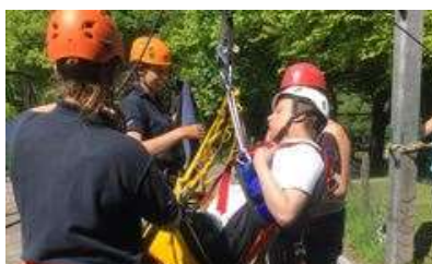
Zip Wire & Abseiling