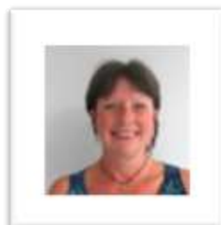
Louise Goode Curriculum & Assessment

Finally, we all found another soft play area which also contained a ball pool, a wavy slide and a death slide. Some students were brave enough to go on the slides. Our students wrung the last bit of fun from the day, before returning back to school, happy and tired. Roll on next years' Kids Day Out!