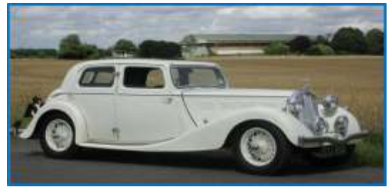
Best in Show Charles Betts 1938 Triumph Vitesse

Visitors both young and old enjoyed looking at some of the amazing VW Camper Vans on show, all lovingly restored by their owners and showing how a past and even present generation of enthusiasts can customise a vehicle to provide comfortable accommodation.