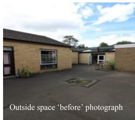
Outside space 'before' photograph

We will keep you informed of progress and will be so pleased to share photographs with you when it is complete.