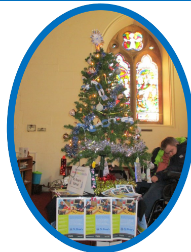
St Rose's Christmas Tree display at St. Laurence Church in Stroud.

This term we also welcomed members of Ecclesiastical Insurance for their Community Day. They helped us with decorating projects and tidying the sensory Garden as well as making a fantastic donation to the school and college.